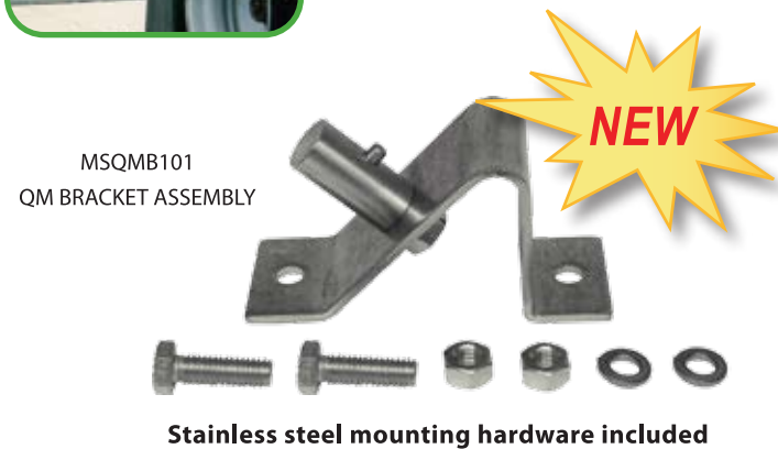
MSQMB101 QM BRACKET ASSEMBLY

Replacement flags are ready for easy installation on the Quickmount Flag Assembly.