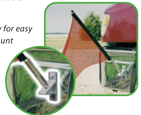
FQM300C QM REPLACEMENT FLAG / RED